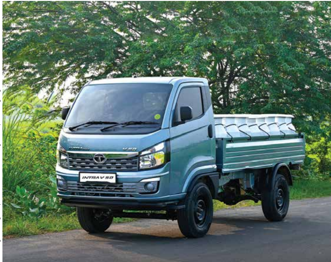
The images are only for representations and actual images of the product may vary.